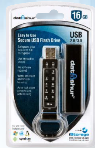
datAshur in retail packaging